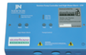
Pump Controller and High Water Alarm.