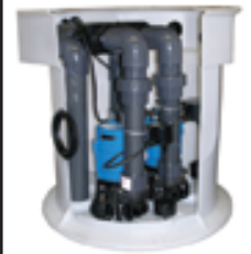
Titan Pro Sump Chamber.