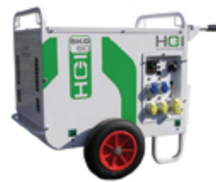
An Independent Self-start Generator.