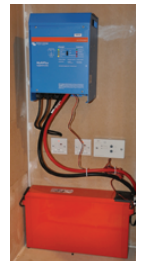
1200 Watt Inverter and Battery.