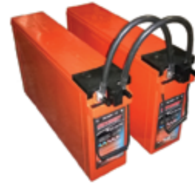
Additional in-line batteries.