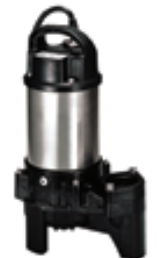
High capacity NP750 Pump.