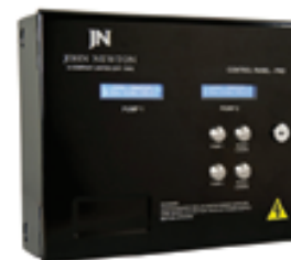
Control Panel Pro with dial down facility.