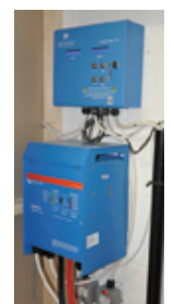
3,000 Watt Inverter.